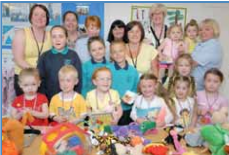
Bluebird Family Centre

Some of the activities included a mini Olympics event, bric-a-brac stall, home baking and a burger and hot dog stand. A big thank you to all the kids and staff at the centre for organising this fun day.